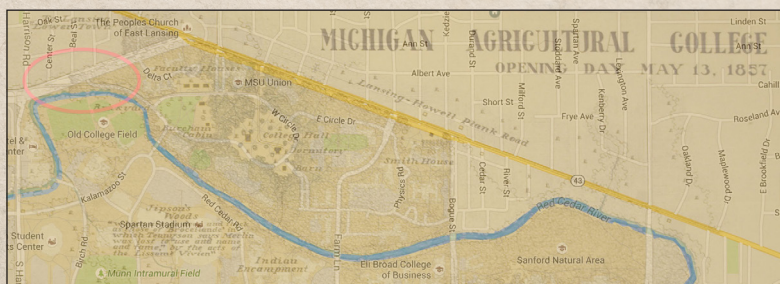
A Michigan Agricultural College map from 1857 overlaid with a modern map of Michigan State University. The circled area indicates the location of the Native encampment in 1857.

Michigan State University occupies the ancestral, traditional, and contemporary Lands of the Anishinaabeg–Three Fires Confederacy of Ojibwe, Odawa, and Potawatomi peoples. The University resides on Land ceded in the 1819 Treaty of Saginaw.